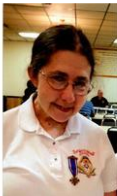
Conkle Funeral Homes.